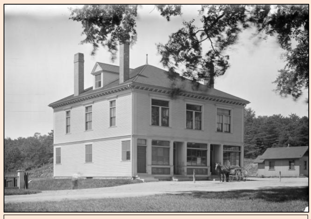
Sawyers Mills Store 1896