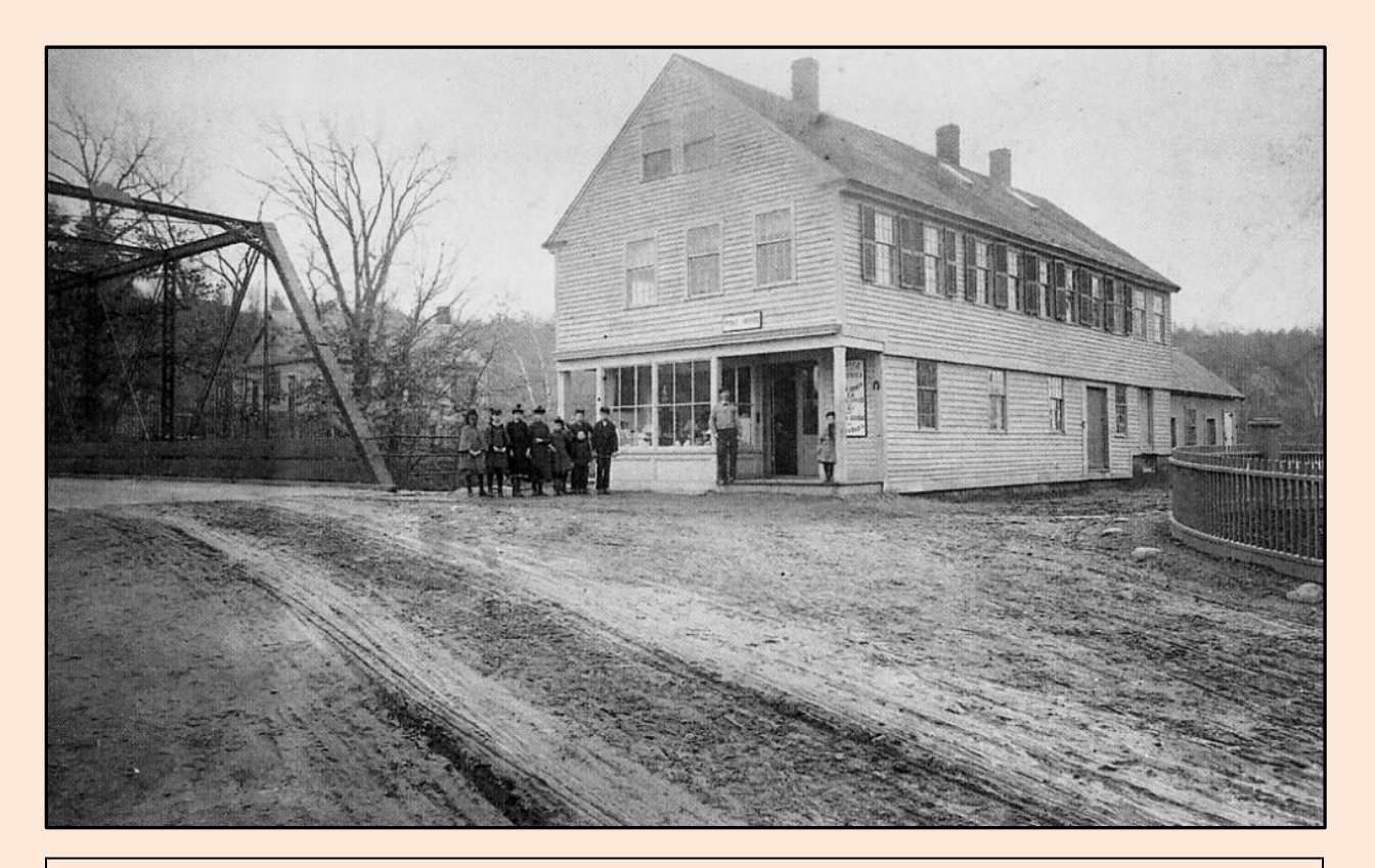
Sawyers Mills Store Date Unknown

The Lancaster Mills Corporation built a new store in 1862, and replaced this store in 1890. It housed the Boylston Post Office and a hall that was used for socials, meetings and Protestant Sunday School.<sup>2</sup> The store and the Boylston-Sawyer's Mills Post Office closed its doors on January 15, 1903 with the building of the Wachusett Reservoir.